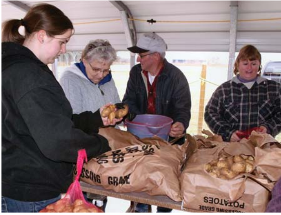
Volunteers under one of the covered pavilions arranged by the Newton-Hamilton potato drop rip open the 50-pound bags of white potatoes and re-package them to be distributed to hungry families all over the region.

who don't know Christ. It has fostered cooperation and communication among the churches, as well as ecumenical involvement with other denominations, and community organizations." ➔