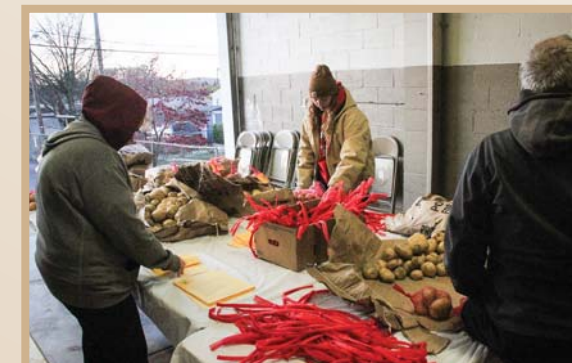
Inside the firehouse in Lemoyne, volunteers bag potatoes for pickup later that morning, by area food pantries and feeding agencies.

Newton-Hamilton UMC brought in even more partners: half the truckload was dropped off at the fairground in Reedsville where the churches of the Lewistown area brought in volunteers and distributed more than 20,000 pounds of potatoes to the agencies in the Lewistown area. Pastor Myfelt says, "It is amazing how people talk about this project and how worthwhile it is. It connects people with the churches involved, including those